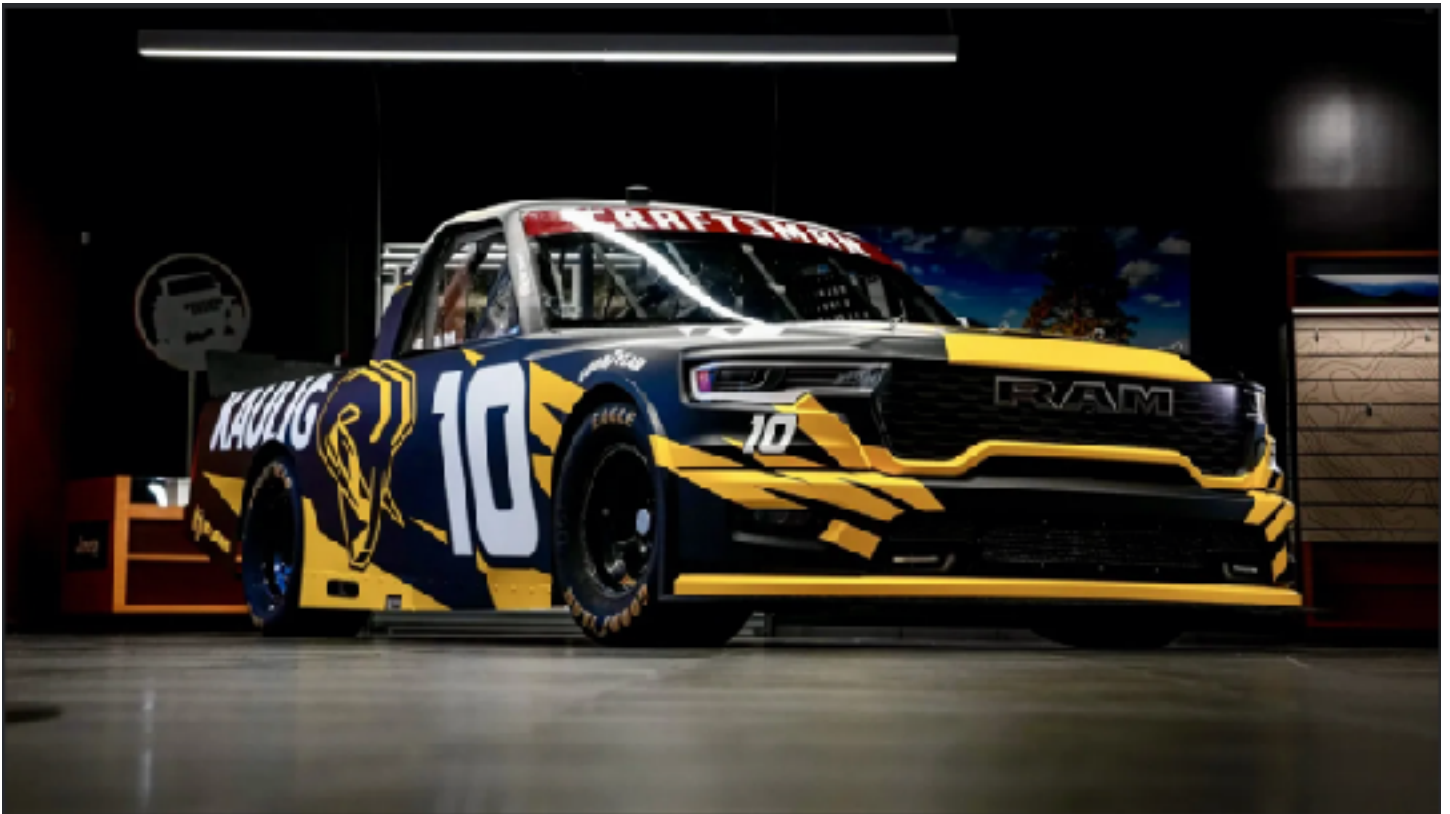
Kaulig Racing joins Ram in the NASCAR Craftsman Truck Series in 2026.