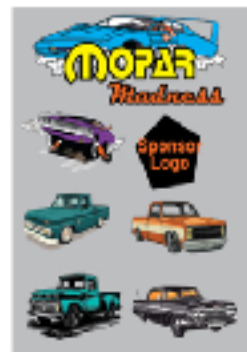
250 - 4"x5" Sticker Sheet